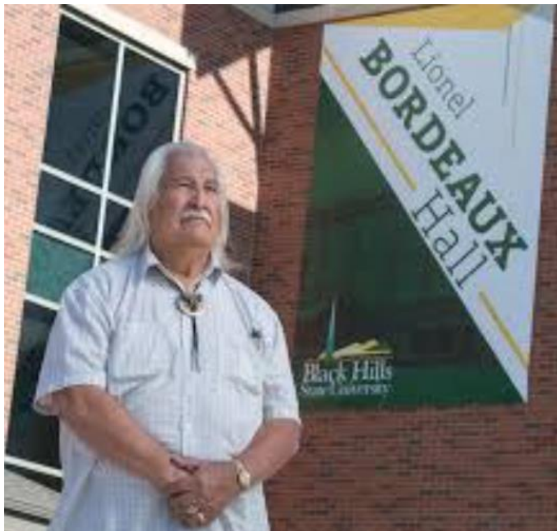
"Bordeaux Hall" located at Black Hills State University