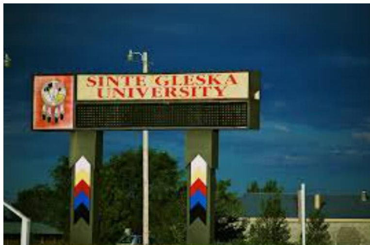
Sinte Gleska University is a private tribal land-grant university in Mission, South Dakota, on the Rosebud Indian Reservation