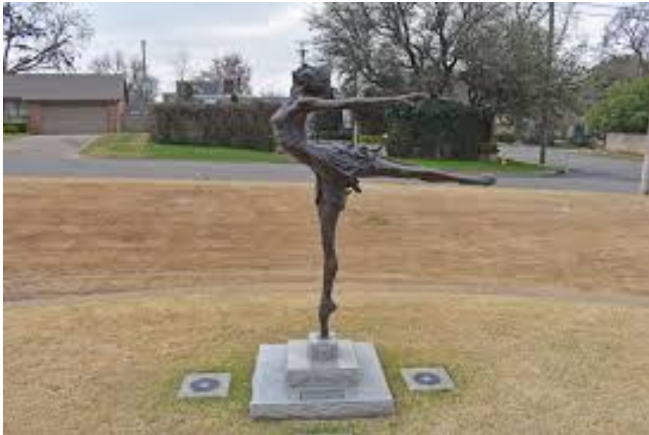
Maria Tallchief, "Five Moons" sculpture at Tulsa Historical Society's Vintage Gardens

Tallchief was honored by the people of Oklahoma with multiple statues and an honorific day. She was inducted in the National Women's Hall of Fame and received a National Medal of Arts. In 1996, Tallchief received a Kennedy Center Honor for lifetime achievements. Her life has been the subject of multiple documentaries and biographies.