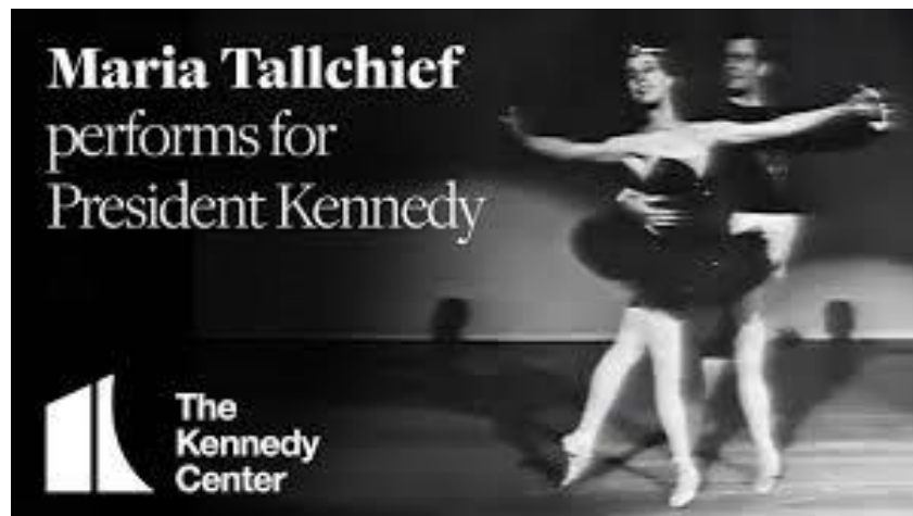
Ballerina Maria Tallchief performs for President John F. Kennedy (1962) The Kennedy Center

How can we utilize Maria Tallchief's legacy to inform our own lives?