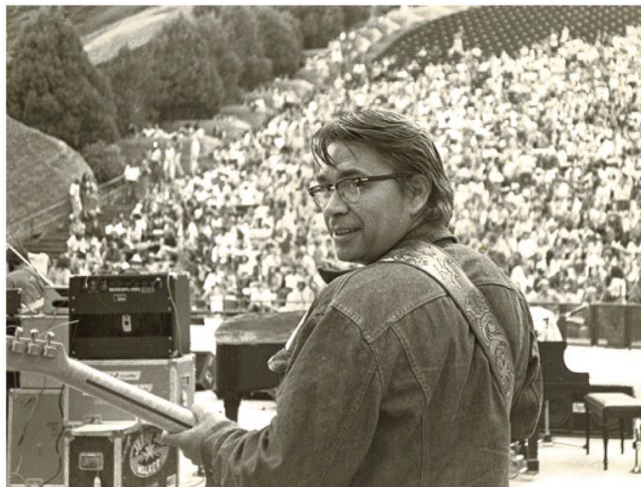
Vine Deloria, Jr. at Red Rocks Amphitheater, Golden, Colorado, 1976

Custer Died for Your Sins , Vine Deloria, Jr., 1969