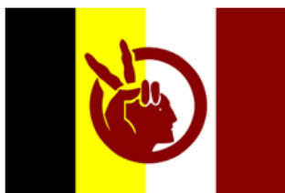
The AIM Flag

In 1968, a new group of young Native Americans met in Minneapolis intent on enacting a new type of protest. Seeing how well media involvement had worked for Blacks and women, the American Indian Movement (AIM) planned protests in prominent places that would garner media attention. The AIM had a three-prong plan to realize their media goals: