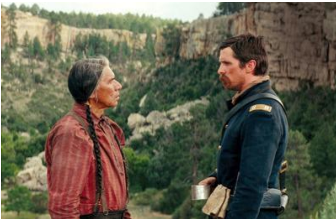
Wes Studi, left, and Christian Bale face off in "Hostiles."

That body of work includes roles in Academy Award-winning films like "Dances With Wolves" and "Avatar," as well as audience hits like "Heat," the starring role in "Geronimo: An American Legend" and his performance as a dying Indian chief in 2017's "Hostiles" opposite Christian Bale.